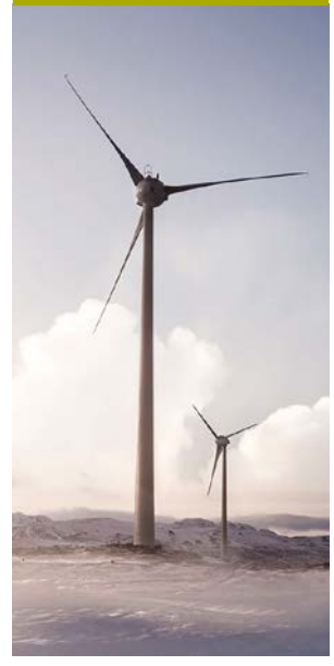
SYNERGIES: Test Enercon turbines installed near the Burfell hydropower plant

The two developments are part of Iceland's latest energy master plan, which is due to be discussed in parliament this year, and would represent the country's first utility-scale