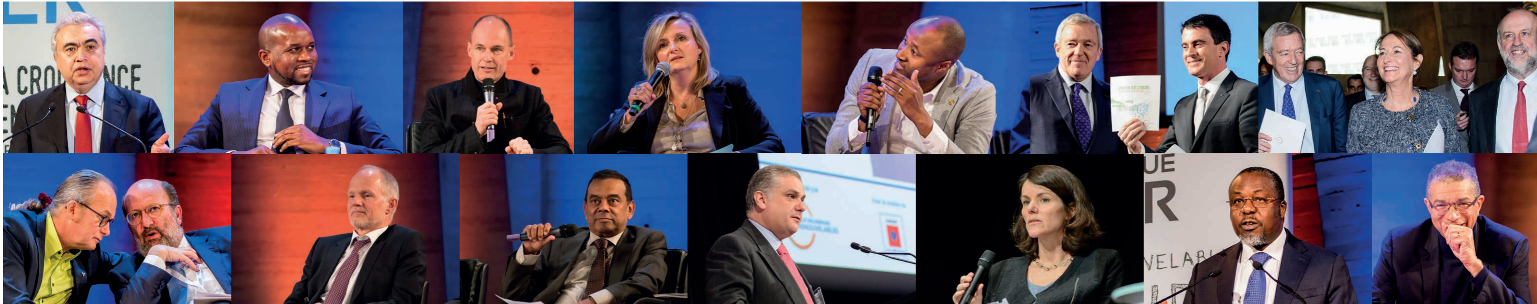
2019 - Claude TURMES, Minister for Energy and Minister for Spatial Planning, Luxembourg, and Joao Pedro MATOS FERNANDES, Minister of Environment and Energy transition, Portugal