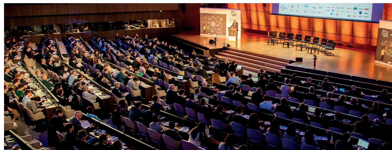
SER © 08/2019 - design : THINK UP

Prime Ministers, Foreign Ministers, Ministers of energy, Ministers of the environment, Ministers of industry, Senior civil servants, European and international experts, Members of parliament, Presidents of the French Regions, CEO's of major energy groups and SME's, NGOs, Trade unions representatives, Economists, international researchers and journalists..., since it first took place in 1999, the SER symposium has been giving the floor to major figures from politics, economics and industry involved in the energy, environment and climate change issues.