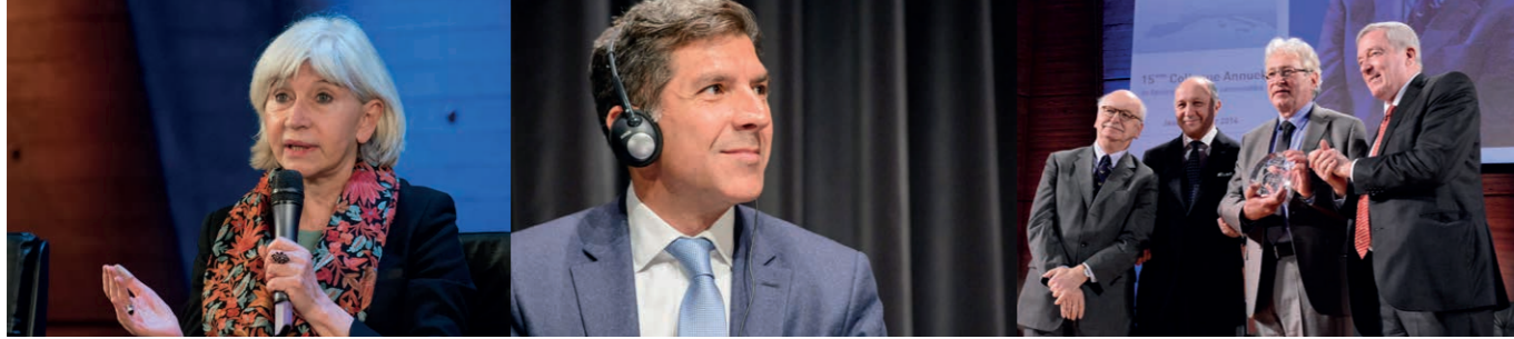
2016 - Laurence TUBIANA, Ambassador in charge of negotiations on climate change during the COP21